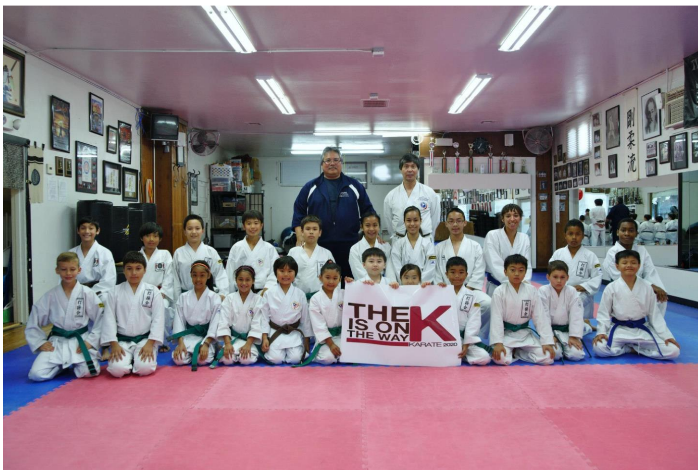
Advance, Intermediate, Beginner/Novice Students