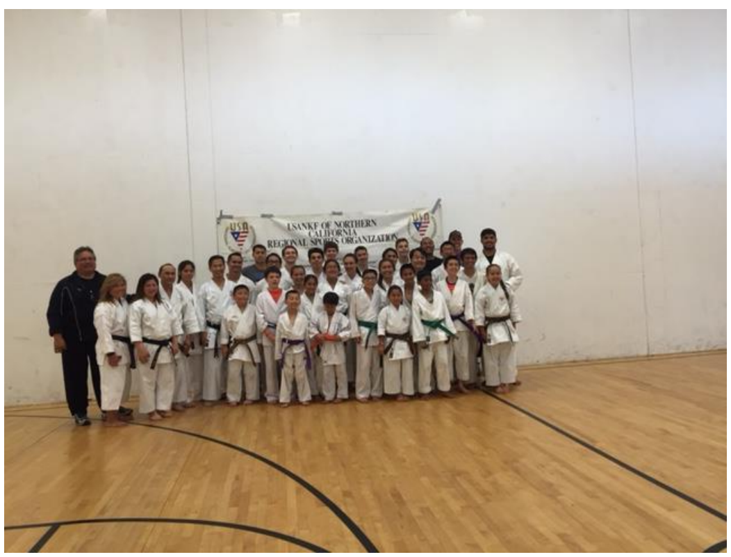
2016 USA Grassroots Karate Program Workshop Coaches and Athletes from Nothern California All working to develop excellence in our athletes Twin Arbors Athletic Club – Sensei Hiers Goju Ryu Dojo in Lodi