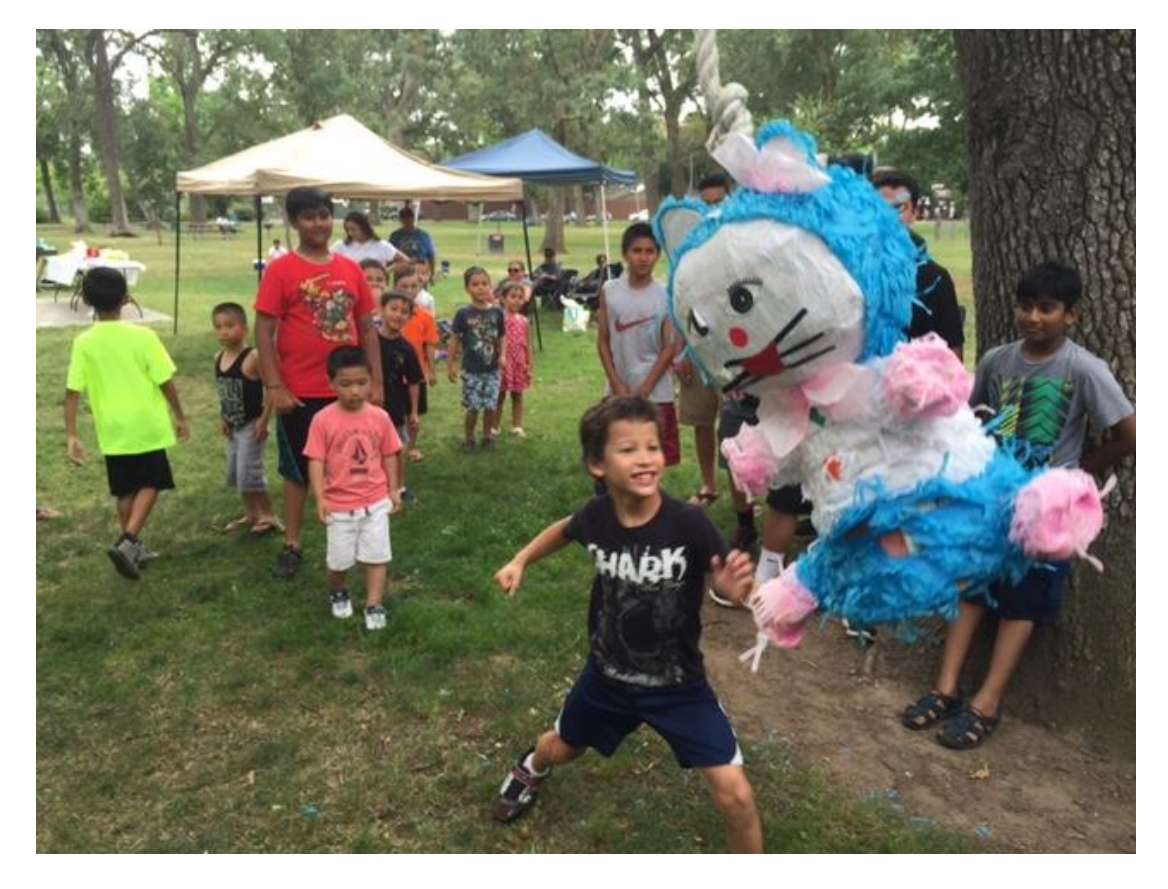
Incredible food, great fun, and wonderful Karate families, at a safe and very clean park Micke Grove Park