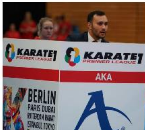
World Karate Federation Licensed Coach Head Coach of Kazakhstan National Team