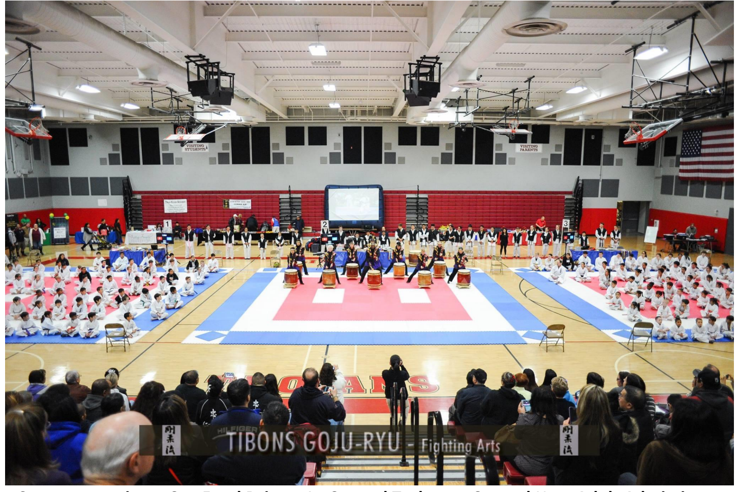
Spectator option – Can Food Drive 1 –Canned Turkey or Canned Ham Adult Admission or 10 – Can Foods for Adult and 5 – Cans for Child Admission to help the needy in the Stockton Community

Register ON LINE Soon at: www.karateTmaster.com