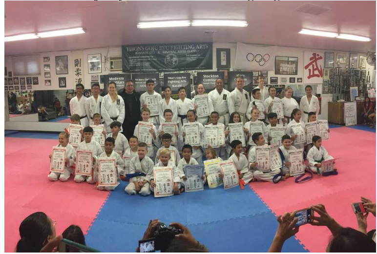
Athletes from all of our Tibon's Goju Ryu Organization Schools

Congratulations! Tibon's Goju Ryu Karate New Ranking August Students