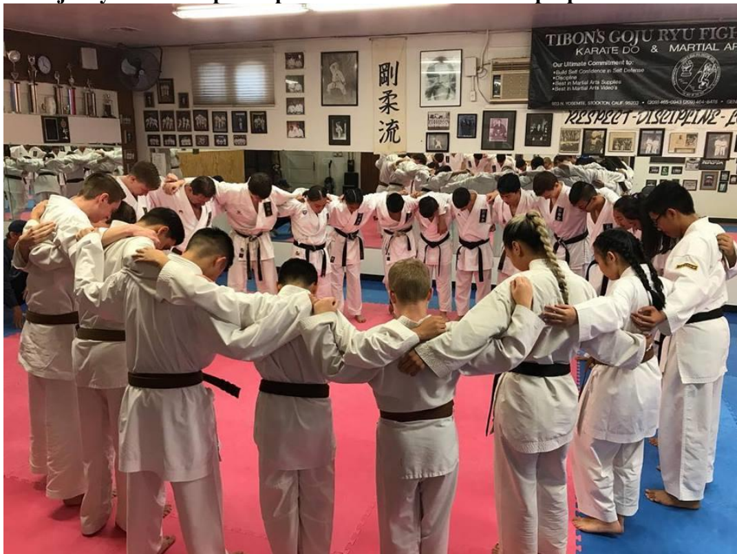
Tibon's Goju Ryu Organization Black Belts Pray for Successful for the next level black belt degree. The pray was successful they all passed their test! Congratulations, it took a whole year of preparation for the test.