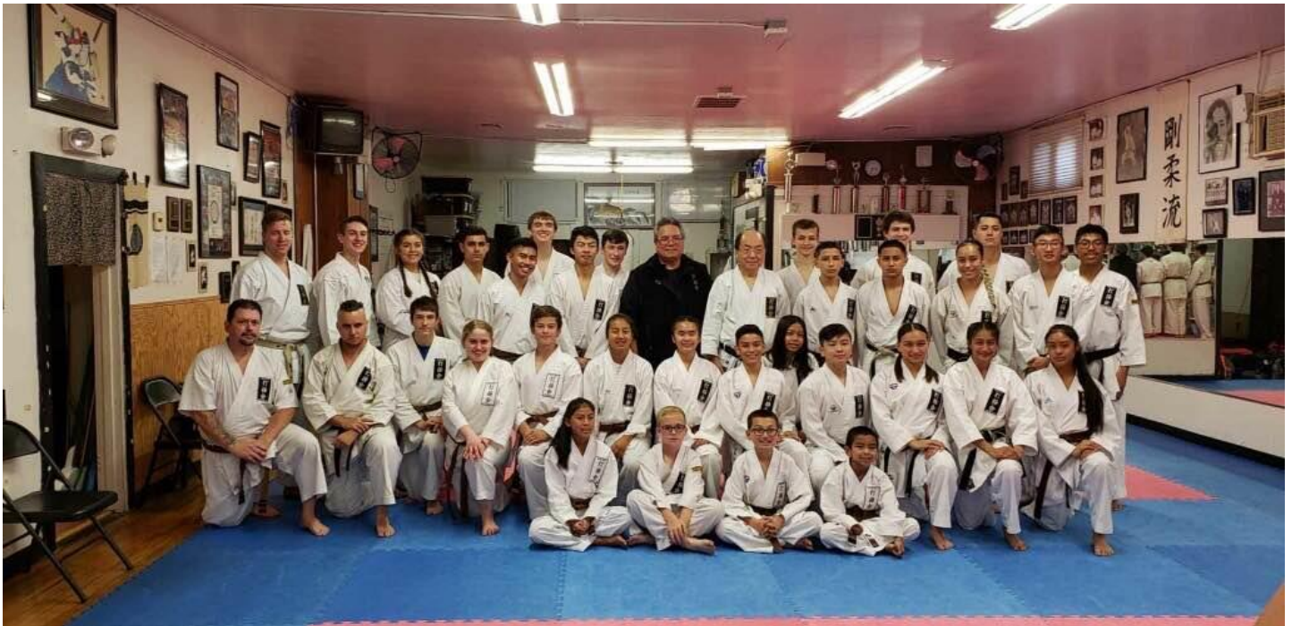
Tibon's Goju Ryu students participate in Masters Seminar to prepare for Black Belt Test