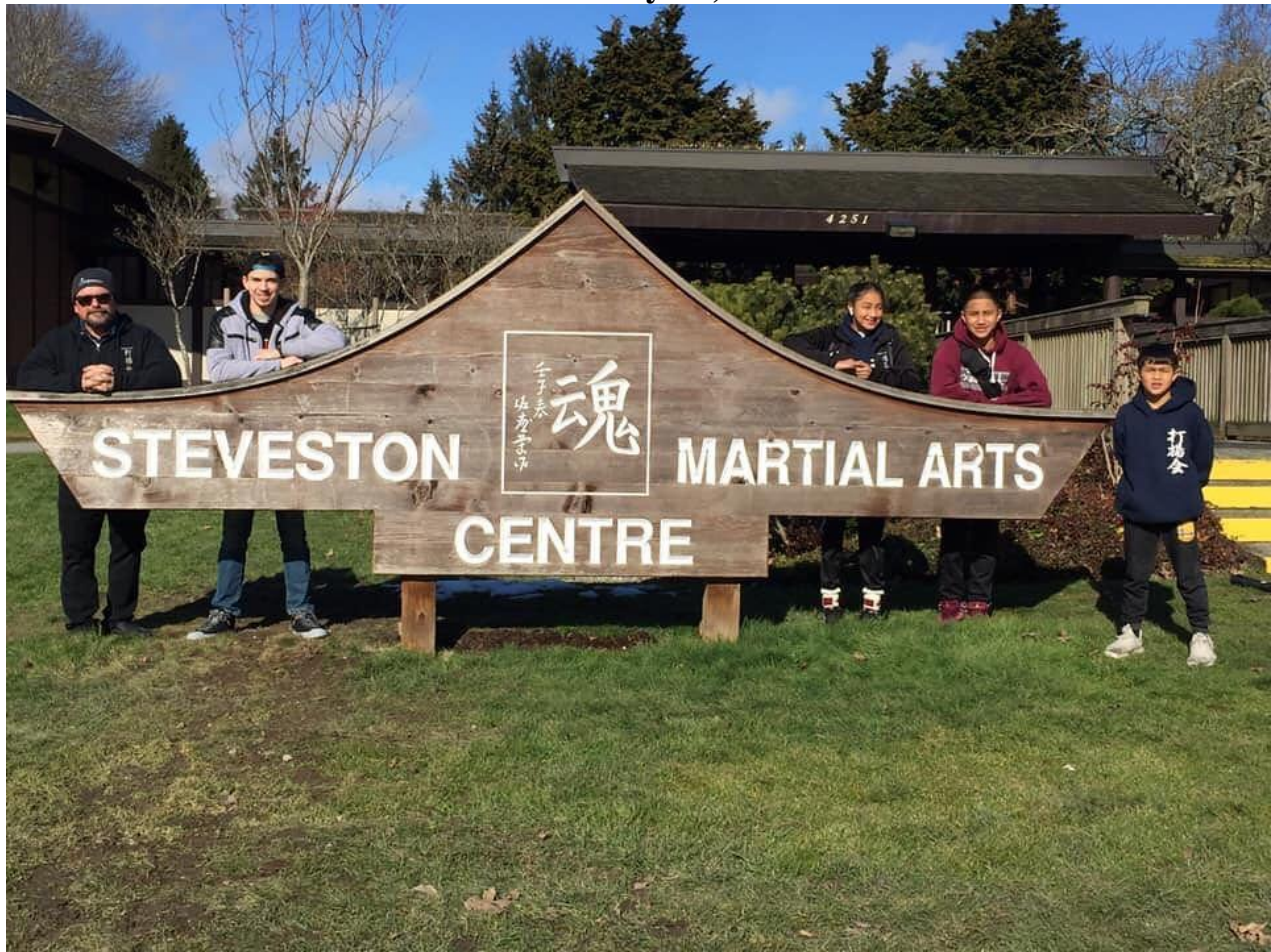
Goju Ryu Uchiage-kai International Headquarters in Richmond B.C. Canada