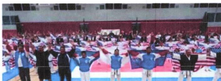
THE GRAND MARCH OF THE FLAGS!

Be a part of the Olympic Day Celebration! Register Online at: